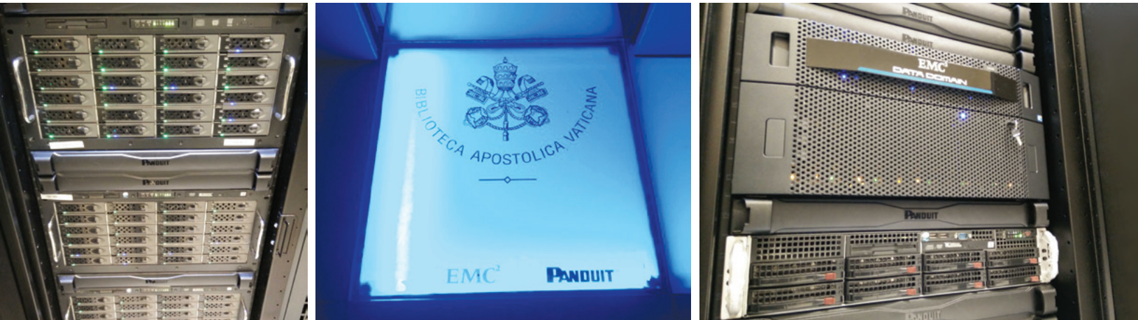
Digitization data backup – EMC 2 Data Domain 2.8 PB of capacity (1.1 TB/hr throughput)

In addition, the data center enhancements would support the Vatican Apostolic Library's commitment to create a setting which allows readers to easily access the manuscripts while avoiding further degradation of the original materials.